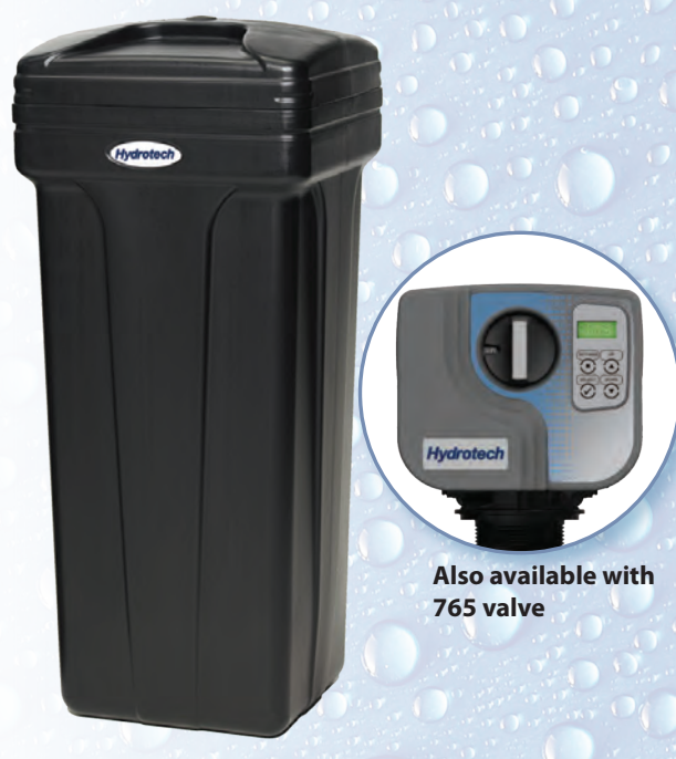
Brine Tank Included